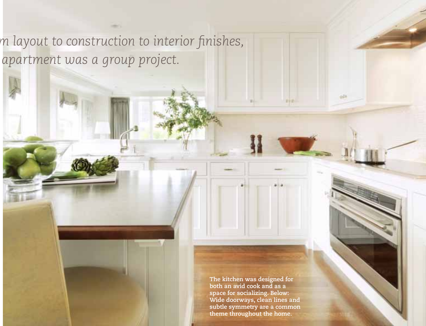
The kitchen was designed for both an avid cook and as a space for socializing. Below: Wide doorways, clean lines and subtle symmetry are a common theme throughout the home.

From layout to construction to interior finishes, the apartment was a group project.