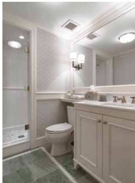
Above: Soothing tones were used in a guest bath. At right: The master bath offers spa-like calm after a busy day in the city. Below: A shoe-lover's dream closet.